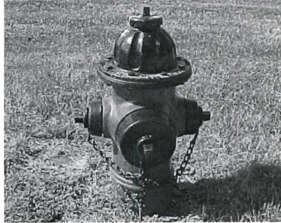
Hydrant in normal position.